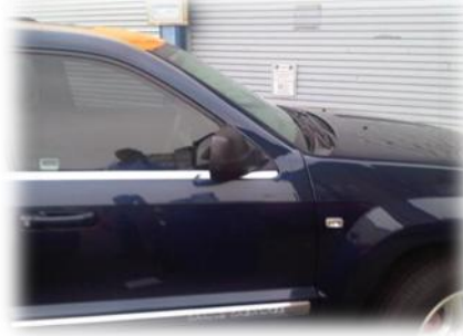
No registration number