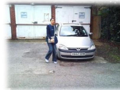
Person is visible