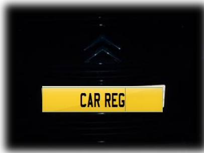
Vehicle not visible