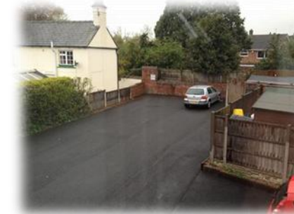
Vehicle too far away